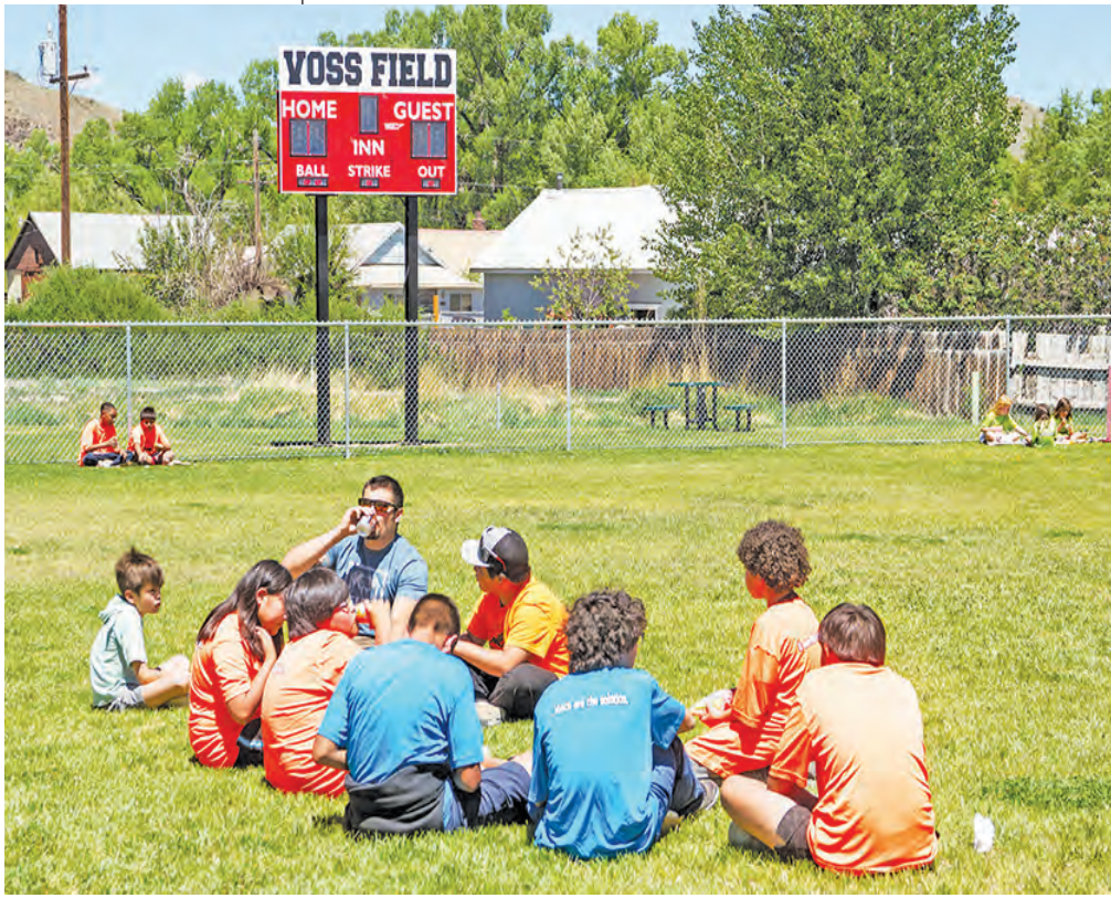
DEL NORTE — After several months of hard work, the Voss Field Renovation Project was officially completed and celebrated during a ribbon-cutting

Looking for a new AG lender? Look no further!